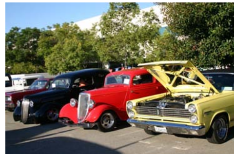
Smile for the camera!!