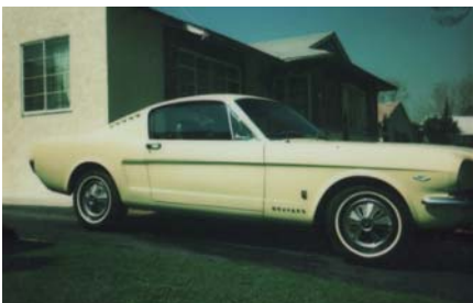
1966 Mustang GT - replaced Camaro but was stolen and all that was found was the dash with key still in it.