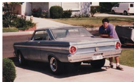
1965 Falcon built for youngest son Patrick