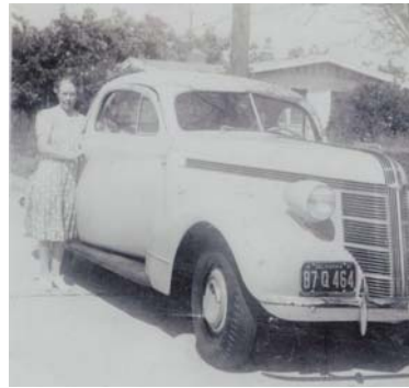
Mike’s first car – 1937 Pontiac The woman is Mike’s aunt – picture taken Dec 6, 1941 - one day before Pearl Harbor