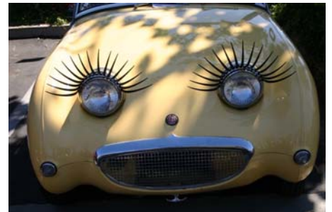
Nice show but there was a problem with "bugs"