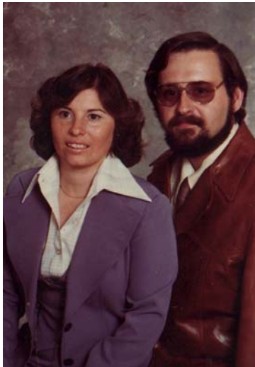
10 year Class Reunion