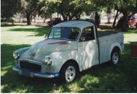
1960 Morris Minor Pick up - older son's car