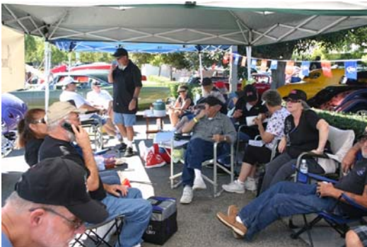
American Streetrodders Club Central