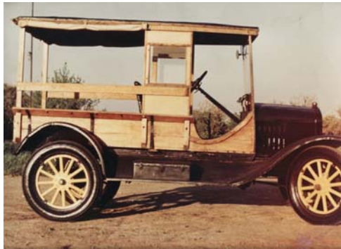
1919 Depot Hack Ford Model T