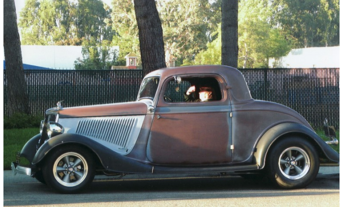
1934 Ford 3 Window Coupe (got for free)