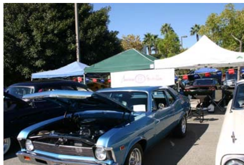
Our club banner was out there for everyone to see