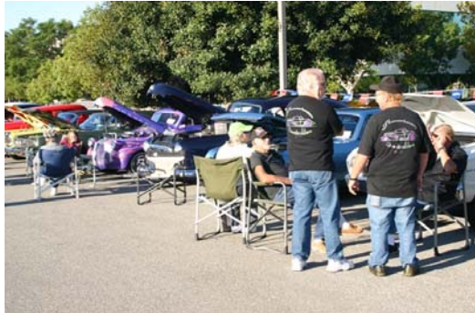
Early morning summit.

It was a great little show and we had good club participation. We even took home the Club Participation trophy but unfortunately, none of our members trophied this year. Oh well, there's always next year.